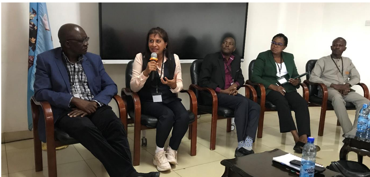
The national expert panel discussion was facilitated by distinguished colleagues from Zimbabwe, Mauritius, Tanzania, Zambia, and Ghana.