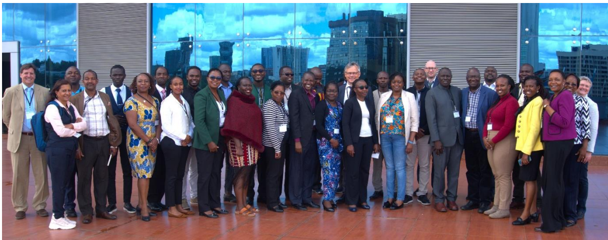
Participants at the Kenya FLW workshop gather on the terrace of the University of Nairobi towers.

This special two-day workshop, "Food Loss and Waste Prevention in Sub-Saharan Africa," was jointly organised by the Global Research Alliance on Agricultural Greenhouse Gases (GRA), The Sustainable Development Solutions Network (SDSN), the University of Nairobi, Kenya, and the Thünen Institute. It brought together 40 active food loss and waste stakeholders from across sub-Saharan Africa who discussed regional context and circumstances for action on FLW prevention, including the challenges and options for action at policy and practice level. It was also an excellent opportunity to strengthen the regional network, exchange experiences and to prepare the FLW workshop in cooperation with the G20 presidency of South Africa in 2025.